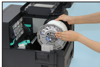
Easy label roll replacement