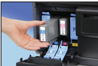
Simple ink cartridge replacement

* Specifications subject to change without notice