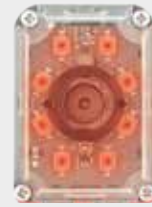
RED WITH POLARIZER