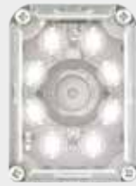
WHITE WITH POLARIZER